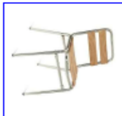
New furniture 470W X 580D