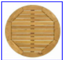
Timber table tops 700mm di